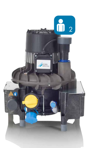
VS 600* Number of practice treatment chairs: 2-3 Number of therapists working at the same time: 2