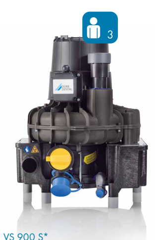
Number of practice treatment chairs: 3-5 Number of therapists working at the same time: 3