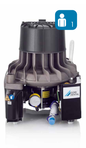
VS 300 S* Number of practice treatment chairs: 1-2 Number of therapists working at the same time: 1