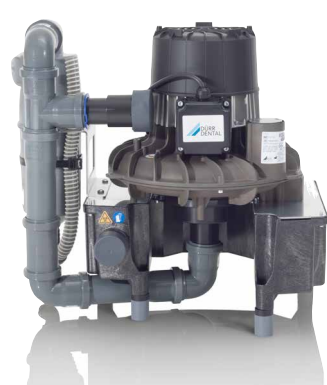
An extensive range of accessories is available for every V suction unit. All models feature a condensation separator as standard.

Number of practice treatment chairs: Up to 14 Number of therapists working at the same time: 8