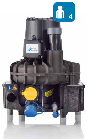
VS 1200 S* Number of practice treatment chairs: 4-6 Number of therapists working at the same time: 4