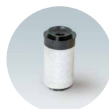
Coalescence filter for membrane drying unit