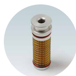
Air intake filter for compressor units

Visit our overview website to help you find the right filter: https://www.duerrdental.com/produkte/druckluft/material-zubehoer/filterauswahl/