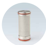
Bacteria filter for membrane drying unit